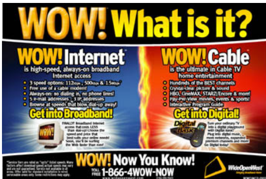
WideOpenWest Magazine Advertisement