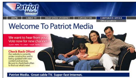
Patriot Media Website - Inital Launch