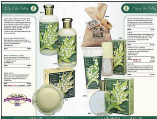
Norfolk Lavender 2001 Catalog