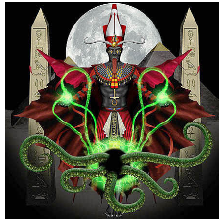
Commissioned Illustration - "Nephren Ka"