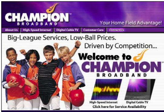
Champion Broadband Website / Identity